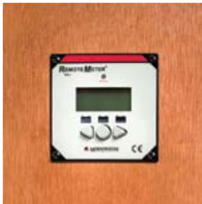
In Wall Mount